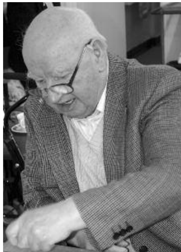
Please note: due to the sensitive nature of this case this photo is posed by a model. It is not Mr A.

Gradually with support, Mr A is regaining his self esteem and his finances have been sorted out, but his relationship with his family has changed forever.